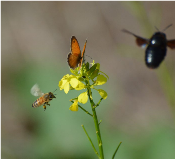
A butterfly feeding on nectar of a crucifer flowers, while a honey bee and a Xylocopa are also arriving at the same flowers.

Competition for food resources mainly concerns floral resources, nectar and pollen , but cannot be fully understood without considering the environmental context in which it occurs. Resource availability varies according to the landscape (more or less complex, rich or poor in semi-natural habitats) and seasonality , as the abundance and diversity of blooms change throughout the year. In heterogeneous environments, with a good variety of plants and flowering periods spread over time, competition tends to be limited.