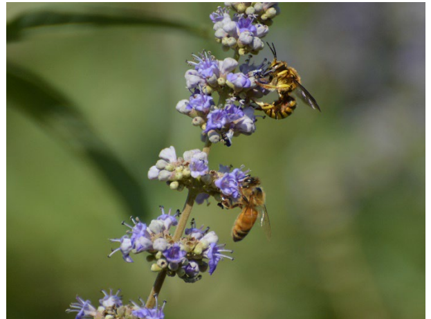
A honey bee and a Anthidium, a wild bee, feeding on the same flowers of Vitex agnus-castus.

In the context of honey bees and wild pollinators, competition mainly involves the shared use of floral resources , such as nectar and pollen, and the transmission of diseases . By contrast, competition for nesting sites or materials is generally little considered, probably because it is largely independent of beekeeping and of the presence of honey bees. Intensive beekeeping, with very high hive densities, can have a significant local impact. However, in Europe, where honey bees and wild pollinators have coevolved in heterogeneous, in flower-rich and heterogeneous environments, each species tends to occupy its own niche, reducing negative effects. Balanced management of beekeeping and the surrounding environment further limits these impacts.